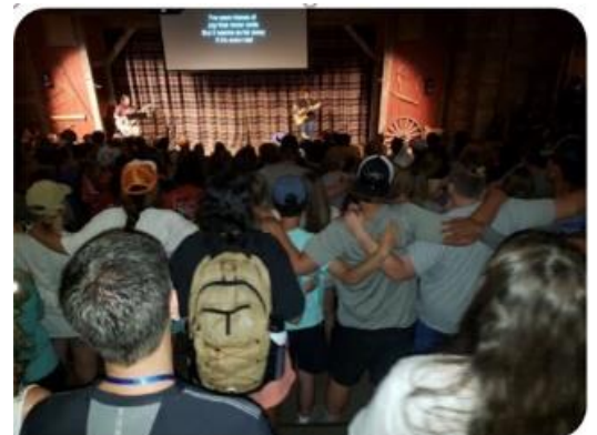
Here is a picture I took while in Scotland.